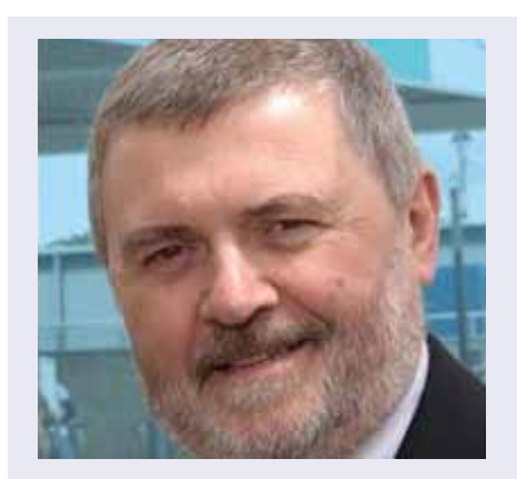
SIR STEVE BULLOCK Mayor London Borough of Lewisham

We need to take a twin tracked approach that gets large schemes going that will deliver at scale and encourage a plethora of smaller schemes which can, literally in some cases, fill in the gaps and release the ideas and energy of local groups